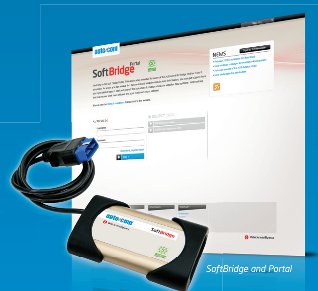
SoftBridge and Portal

To make things even easier Autocom is now setting up a new website called the SoftBridge-portal that will launch every time you connect your SoftBridge to the computer. On the SoftBridge-portal you will among other things be able to get help, training, support and find direct links to all vehicle manufacturers Internet portals.